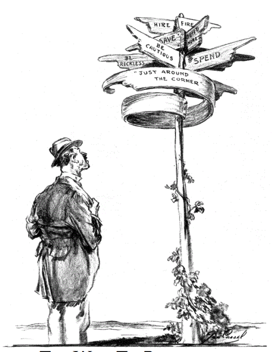
THE WAY TO PROSPERITY.